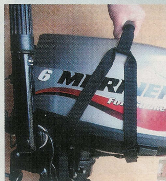
Above: The Motor Grip on a 2hp Honda. Above right: The Grip on a 6hp Mariner. Below left: The o/b is much easier to handle with the Grip in place. Below right: Clip to tidy excess webbing.

Grip can only really be used for lifting or lowering the outboard vertically – in other words between boat and tender or out of a well – it cannot be used for carrying the motor while walking along a pontoon or the drive leg will drag on the pontoon or ground.